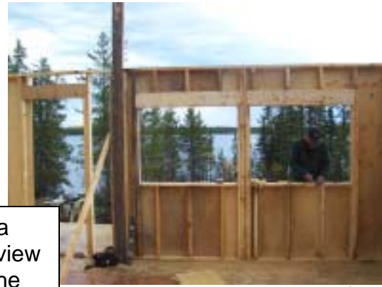
What a great view from the new cabin at Longish and how about that sunset!

Longish Lakes Outpost- The new outpost is well on its way. The majority of the framing is completed. Longish Lakes is made up of several lakes "chained" together. The walleye fishing is unbelievable. One could easily boat a hundred fish a day. It will be important for clients to practice "catch and release" in this waterway as well as faithfully pinching down the barb so fish can be released unharmed. The camp will be available by mid June for fishing parties. Longish will not likely be bear hunted until spring 2008.